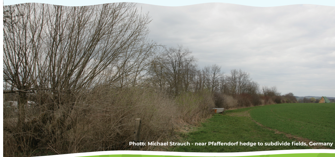
Photo: Michael Strauch - near Pfaffendorf hedge to subdivide fields, Germany