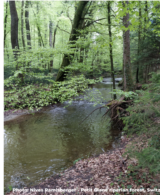
Petit Glane riparian forest, Switzerland

They are also compiled in OPTAIN's Learning Environment (linked to both mentioned platforms) and described in the OPTAIN catalogue, where users can browse, and download the factsheets directly.