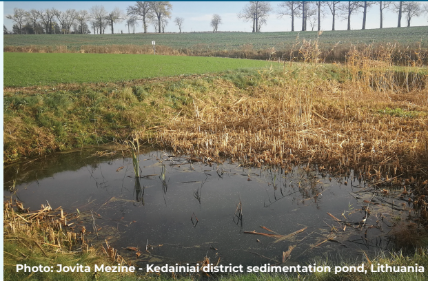
Kedainiai district sedimentation pond, Lithuania

Across the OPTAIN case studies, 66 NSWORMs were ultimately selected from an inventory of 235 measures, representing 29 relevant NWRM categories. Although many categories are represented by only one intervention, several recur across case studies, signalling their broad applicability. The most frequently selected are buffer strips and hedges (ten), green cover (five), no-till agriculture (four), and wetland restoration (four).