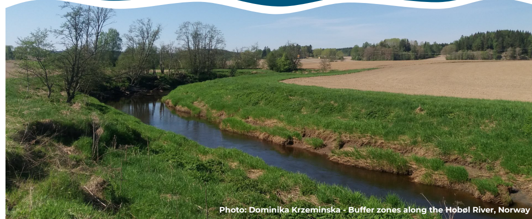
Buffer zones along the Hobøl River, Norway