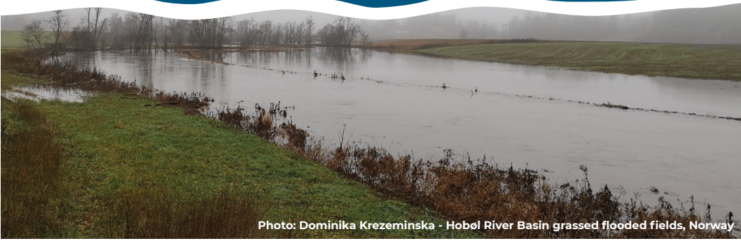
Hobøl River Basin grassed flooded fields, Norway